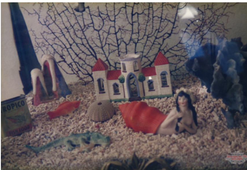
Closeup of an aquarium showing coral sand, a German mermaid in a shell, vintage fish food tin, various aquarium ornaments including a bisque goldfish floater, plus black sea fan and blue coral.