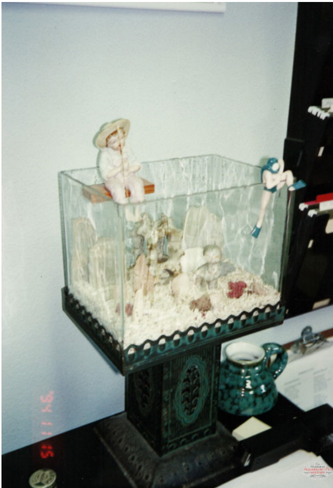
20.) 1920s Relpaw (made in Germany) fish bowl and holder with coral sand, fishing boy, and interesting diver escaping from the one-piece blown fishbowl.