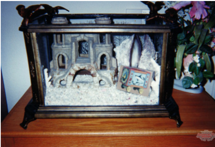
Rare small “eagle finial” Victorian-era aquarium with coral sand, a large terra cotta castle (from the 1890s-1910), and an interesting old advertising card with a fish wagon.