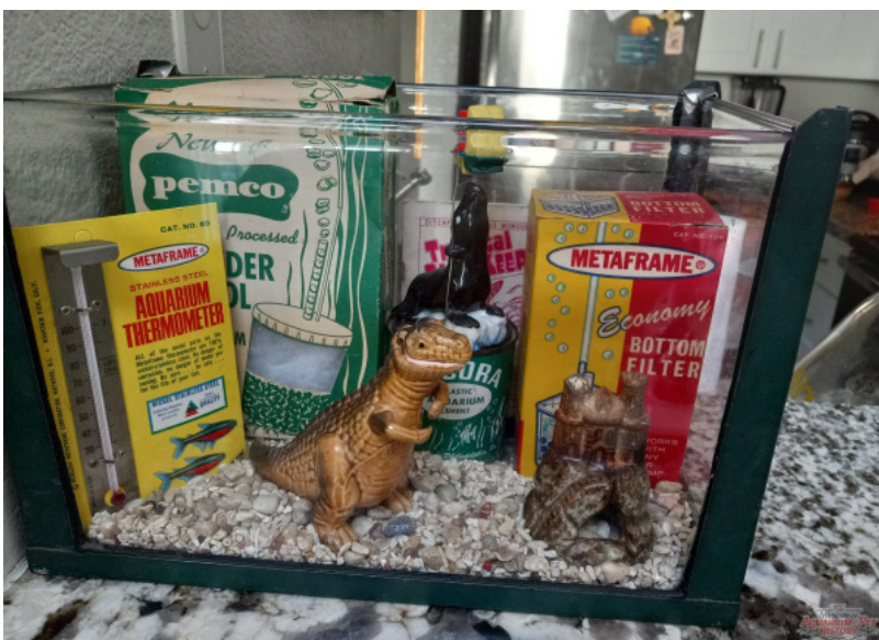
Black splatter-paint aquarium made by Aquarium Stock Company in the 1950s. They used large coral sand, a combination of vintage aquarium products and a small castle.