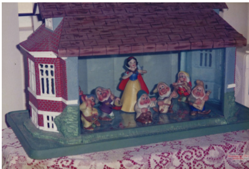
1930s Jewel "Bungalow" Aquarium with a charming set of vintage sleeping beauty ornaments.