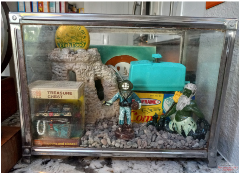
A small aluminum Jewel Aquarium made in the 1930s. Contains large size pebble gravel with vintage ornaments and a castle including a vintage Penn-Plax ornament.