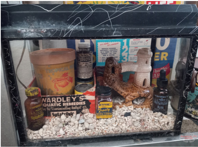
A Metaframe aquarium used to display vintage 1960-70s Metaframe products inside.