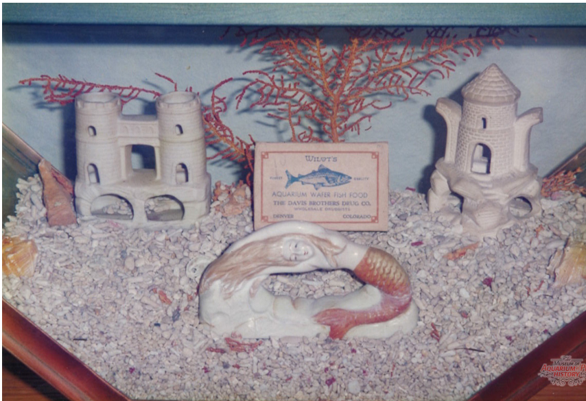
Closeup of an aquarium showing coral sand, 1940s “flowing” mermaid, a vintage fish food box, and two small German ceramic castles.