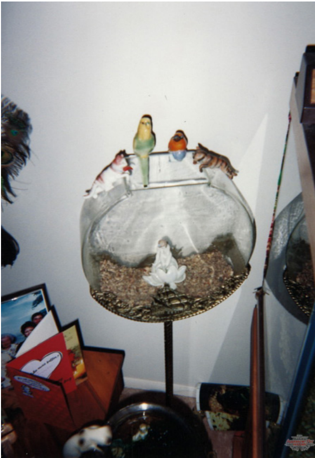
1920s fishbowl stand with modern reproduction bowl, includes gravel, bathing beauty in lotus flower, cat hangers, and bird sitters.