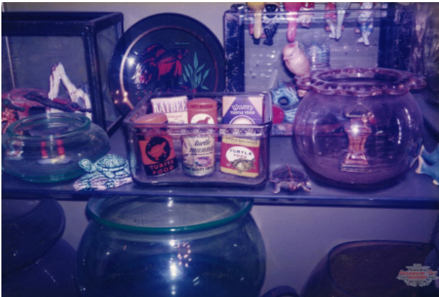
Gillinger Brothers 1920s embossed glass turtle bowl with vintage turtle tins and boxes inside.