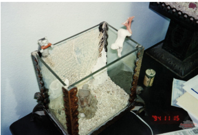
1930s Relpaw small 2-gallon fish tank with coral sand, small castle, sea fan, hanging cat, and rare vintage diving mermaid.