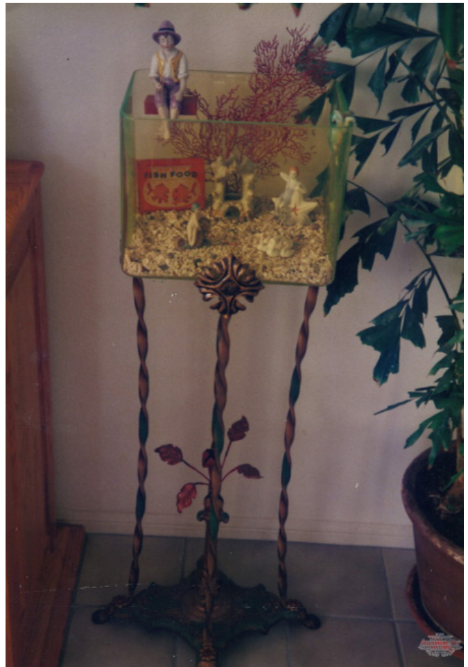
1920s Vaseline fishbowl with stand, which includes coral sand, bisque ornaments, vintage fish food box, sea fan in the back, and fishing boy sitter on the top back rim.