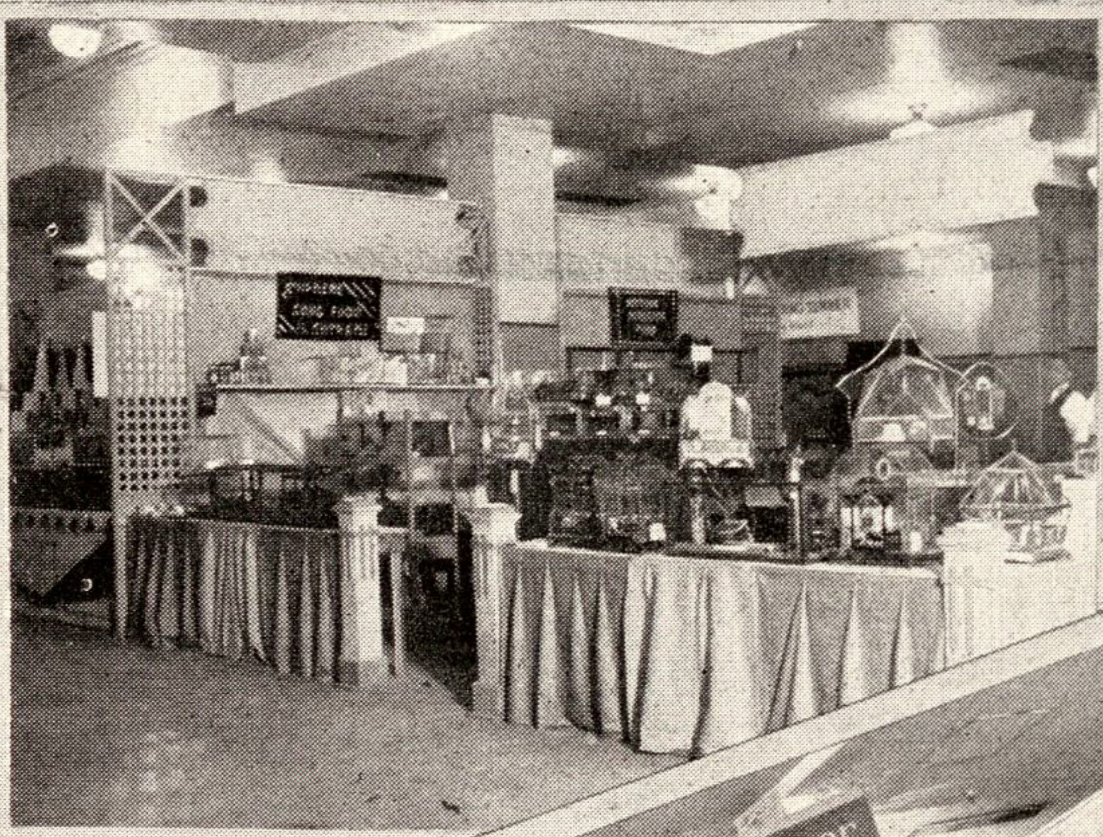
CARL THOMPSON CO. and Japanese Goldfish Hatchery Display