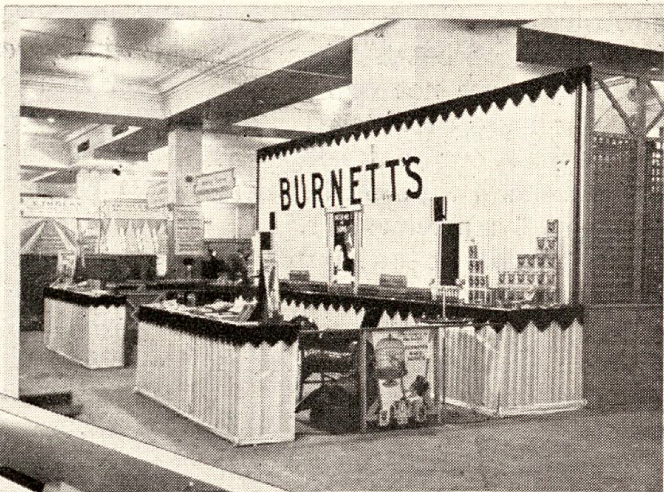
BURNETT'S Handsome Booth Appealed to All