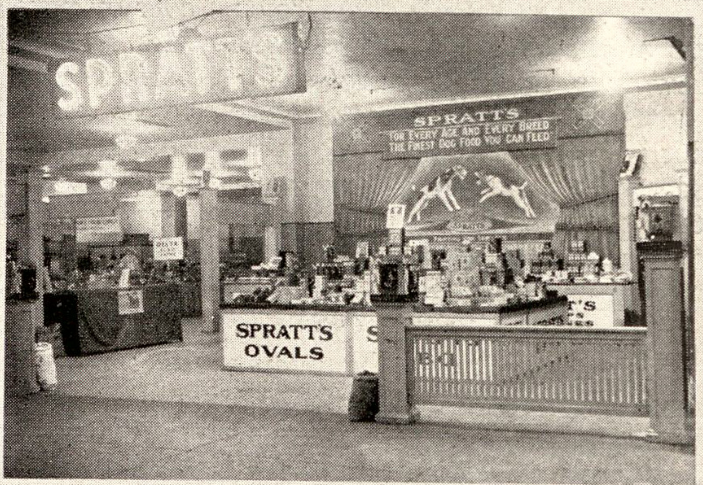
SPRATT'S Always Makes a Good Showing