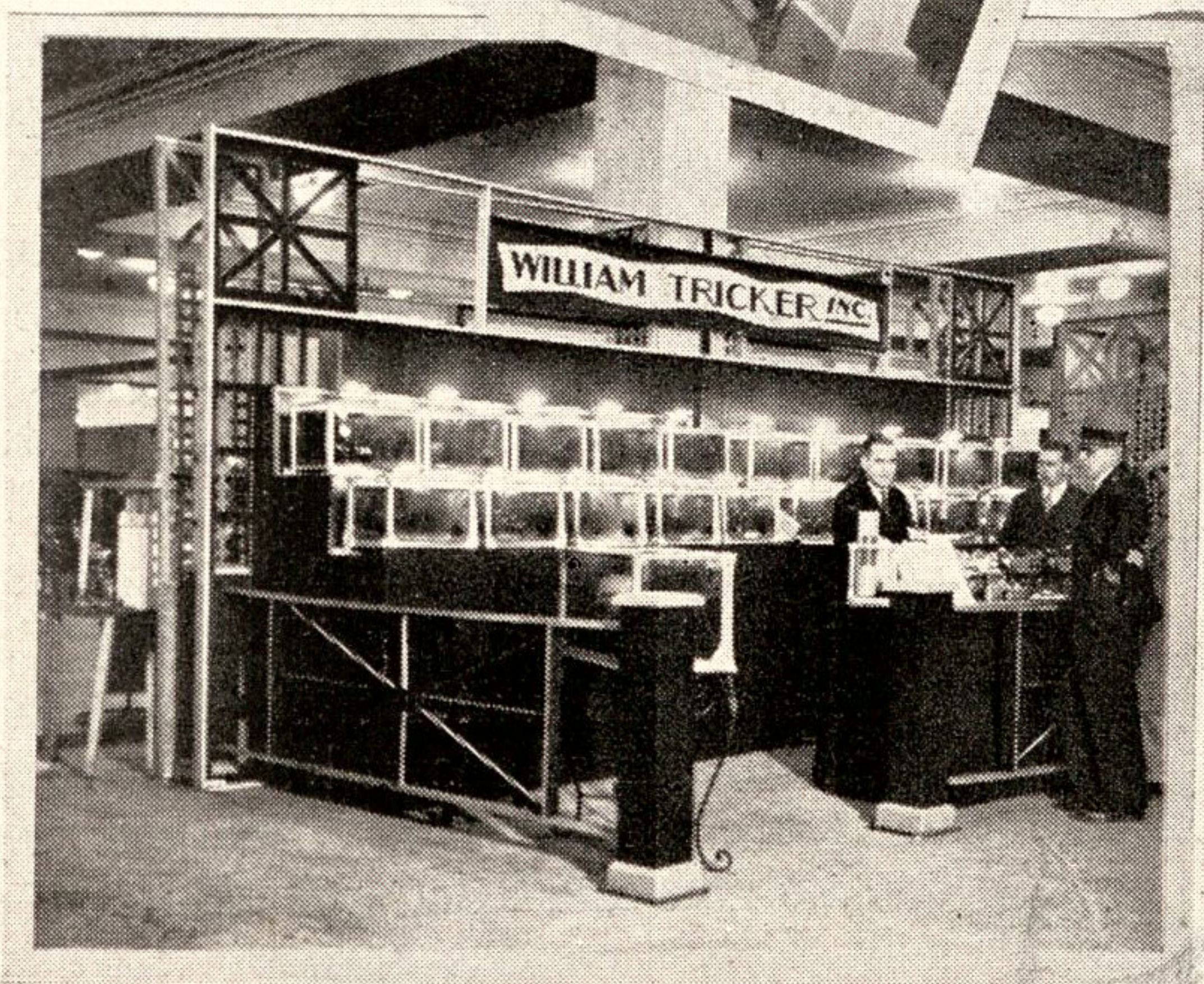
WM. TRICKER, Inc. Had a Wonderful Display at this Attractive Booth