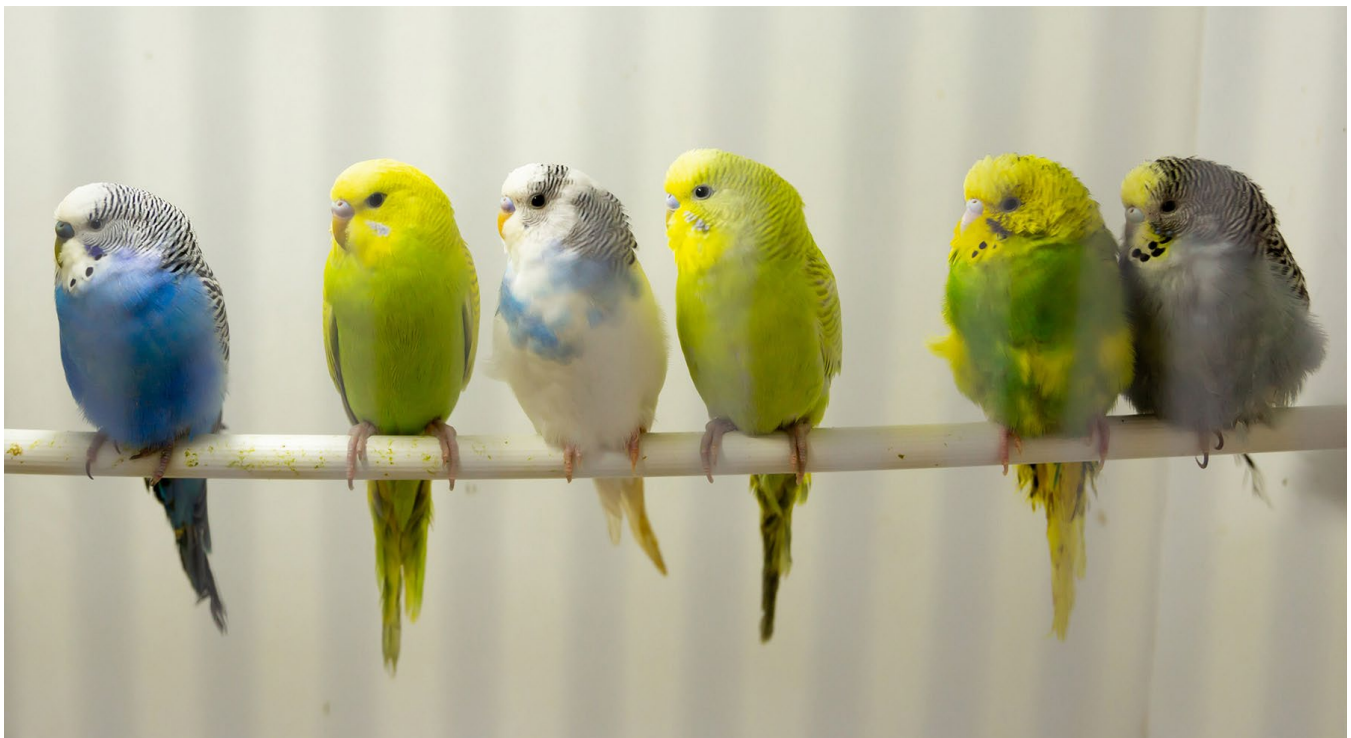
Variety of captive budgerigars