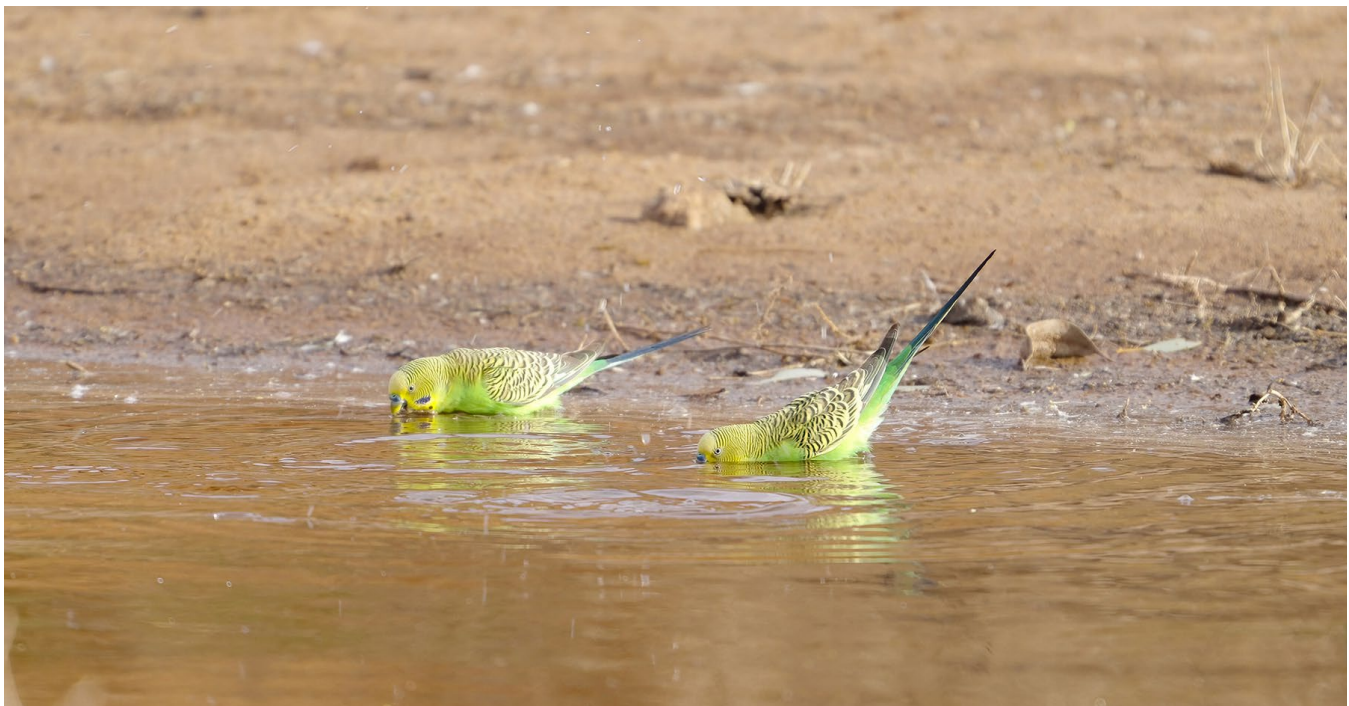
Wild budgerigars at watering hole

It is known for its population fluctuations, based almost entirely upon the amount of rainfall. With the onset of rains, the breeding season begins and in a wet summer, when seeding grasses (porcupine grass and salt-bush in particular), become abundant, the budgerigar breeds in large numbers. It is in such years in particular that the bird becomes noticed for its 'murmurations', that is, closely flying huge flocks which can amount to several thousand in number.