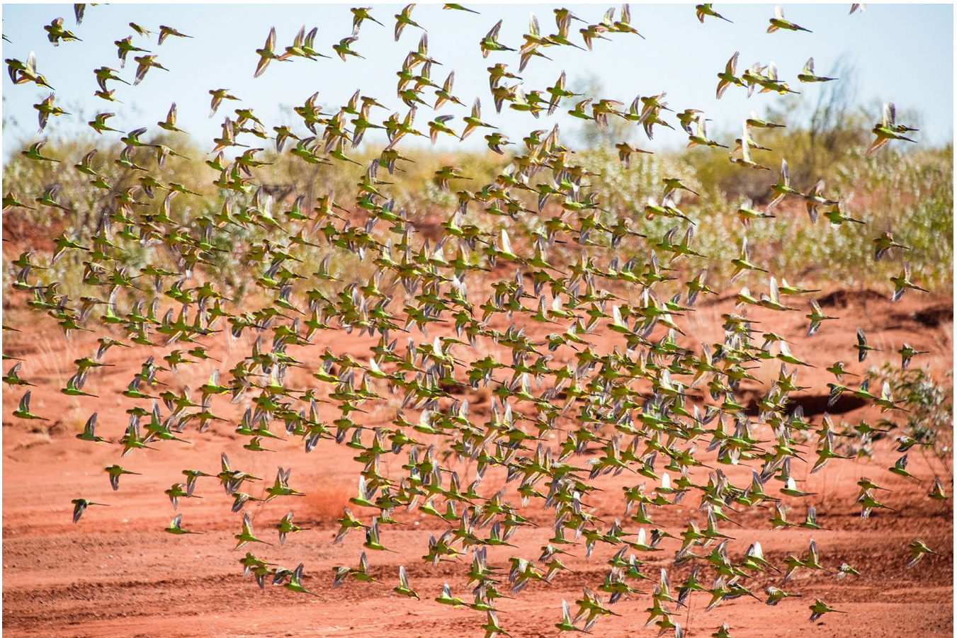
Wild budgerigar flock

As far as we know, the bird first became known to people outside of Australia when four live birds were brought back to the UK by the eminent ornithologist, John Gould. That was in the year 1840. Most of the birds and mammals that Gould brought back from his expedition failed to survive as anything other than stuffed specimens, but the budgerigar proved to be resilient.