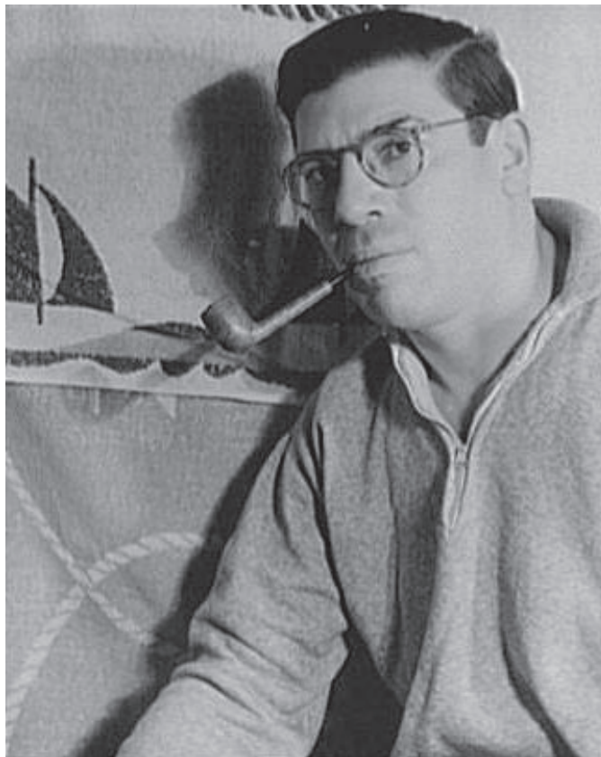
The author Paul Gallico, photographed by Carl Van Vechten in 1937.