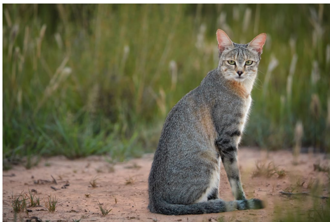
An African wildcat.

Nor was Colette's involvement with cats confined to domestic individuals. She even had an African wild cat for a period, whom she christened Ba-tou and featured in her work La Maison de Claudine which appeared in 1922. She described Ba-tou as being less secretive than domestic cats. In fact, his obvious predatory instincts meant that he finally had to be sent to a zoo, rather than remaining as a pet alongside the rest of Colette's menagerie.