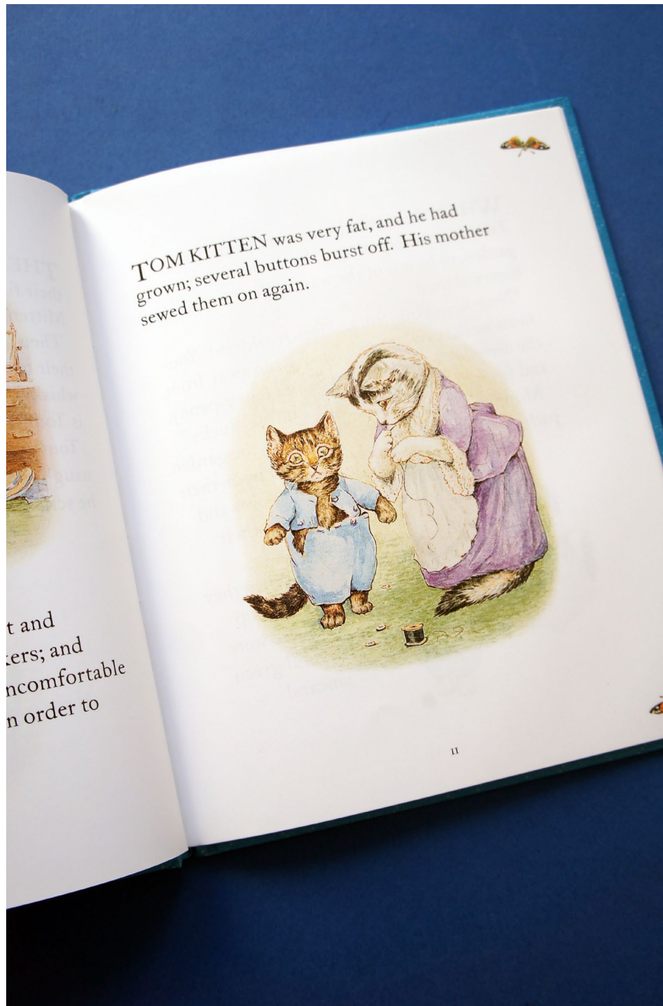
Tom Kitten with his mother.