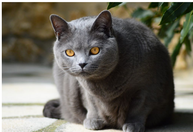
The exceedingly rare Chartreux breed.