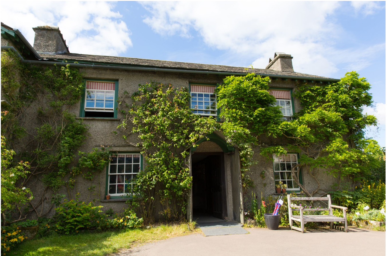
Hill Top House near Sawrey in England's Lake District was Beatrix Potter's home, and provided the setting where Tom Kitten and his family lived.