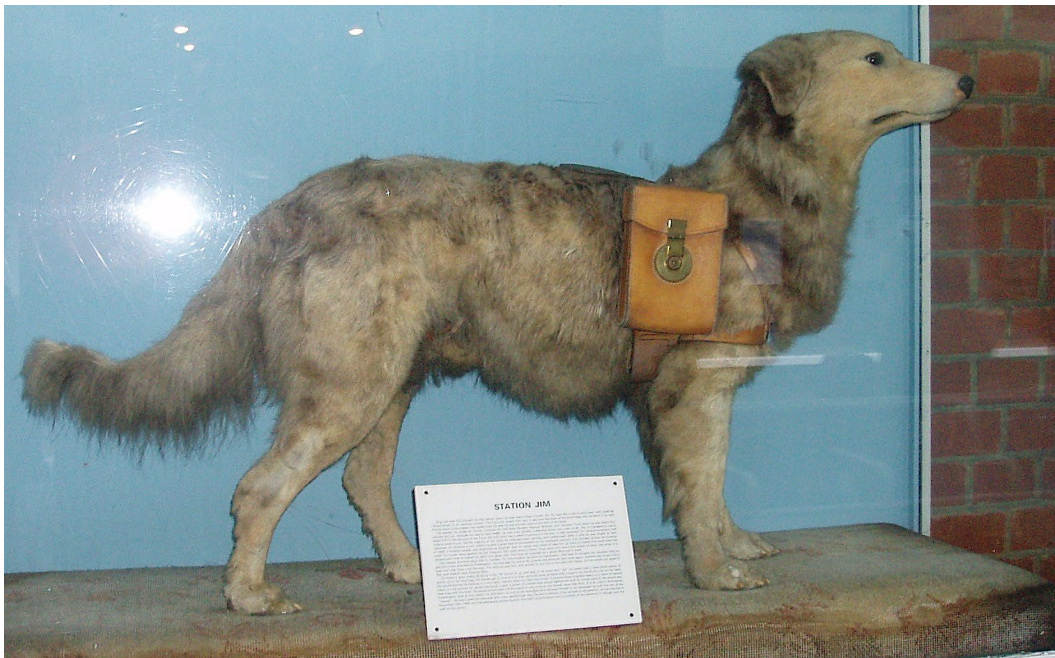
Station Jim is one of the very few railway collecting dogs still to be seen at the station where he worked. He is now located close to platform 5, at Slough railway station in Berkshire.

Station Jim was also ready to travel further afield on his own initiative, in search of funds. He was not adverse to catching the train to Leamington Spa for example, a journey which took just over an hour, and he would then be sent home again to Slough.