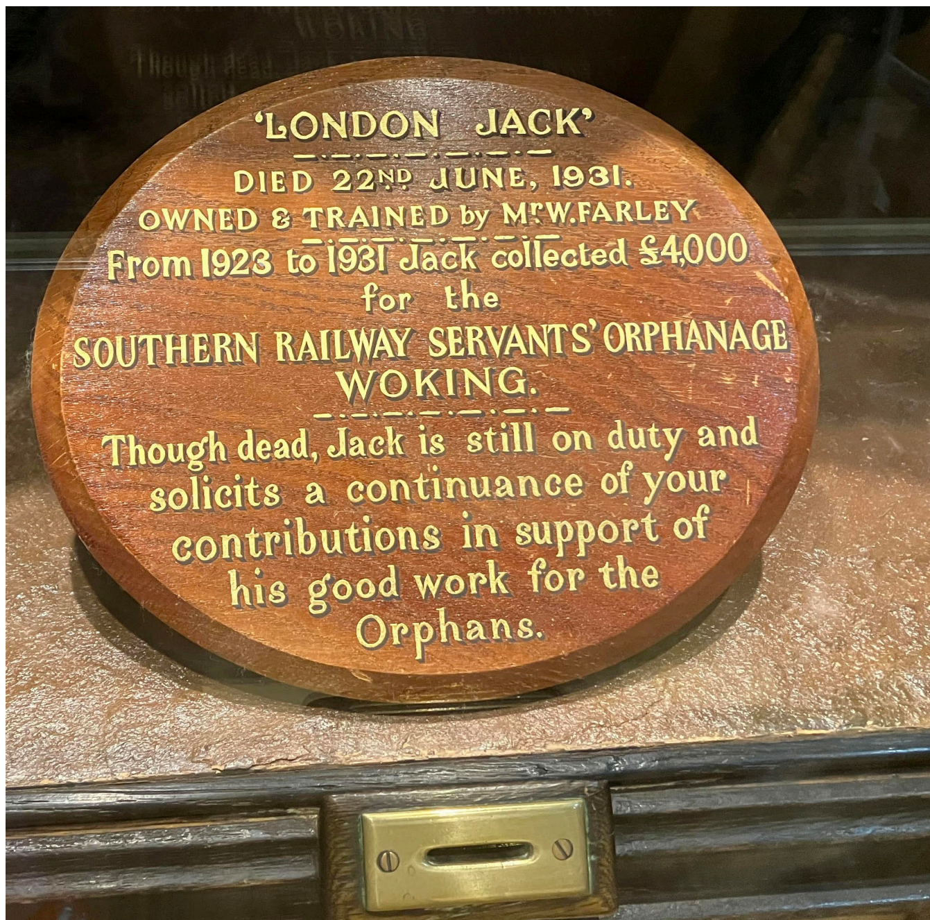
The plaque that can still be seen alongside London Jack, in the display case at the Bluebell Railway today.

Then there was another London Jack – a name that had become very popular amongst the capital's railway collecting dogs by this stage. He collected a total of £400/$540 during his working lifetime, in a box that he carried on his back, and also had an impressive array of silver and gold medals awarded to him for his fund-raising activities. This particular London Jack was finally transferred to a display case in the museum of the famous volunteer-run historic Bluebell Railway at Sheffield Park, in East Sussex, after his demise.