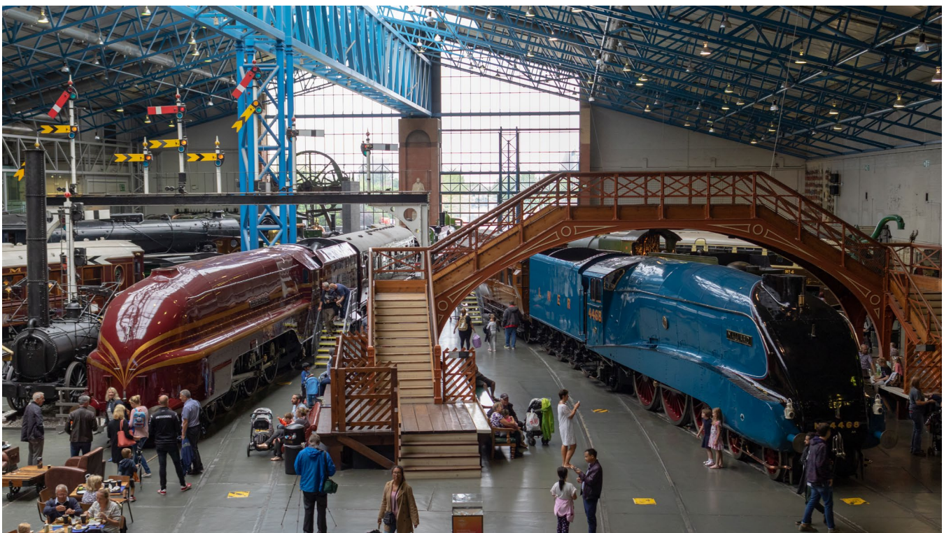
The National Railway Museum in York, in northern England, has become home to some of the country's railway collecting dogs that were passed to taxidermists after their demise.

Although later found, London Jack was apparently badly affected by this experience. In spite of being sent to the Isle of Wight for a period of convalescence, he sadly died soon afterwards.