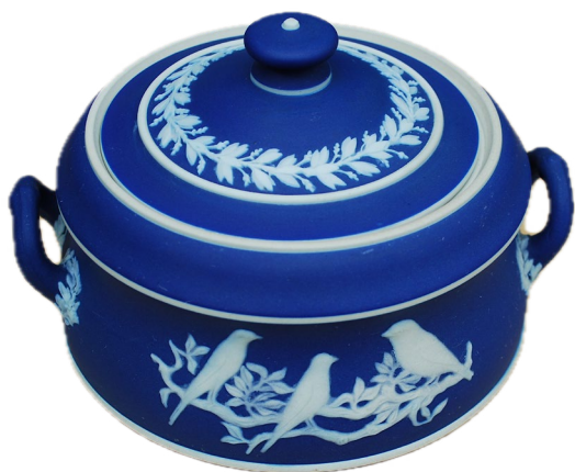
Wedgood/Capern's sugar bowl