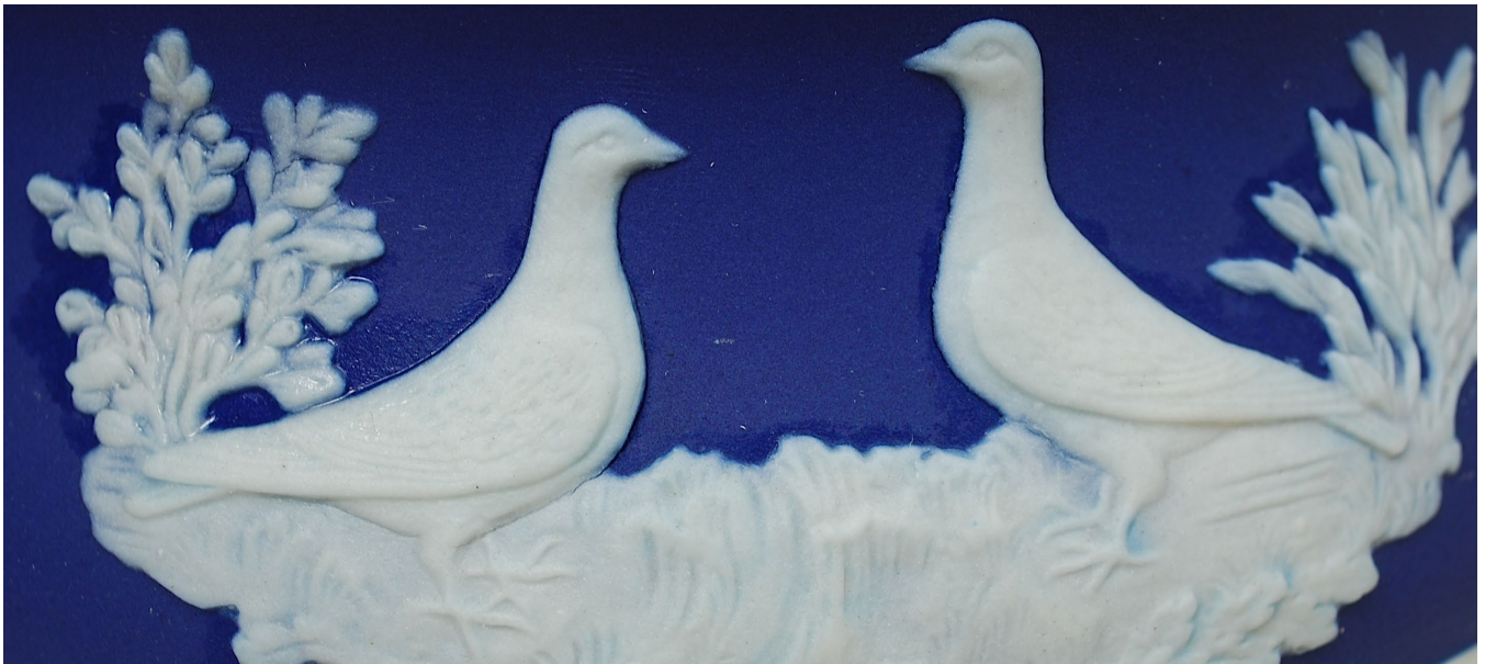
Wedgood/Capern's pigeon detail