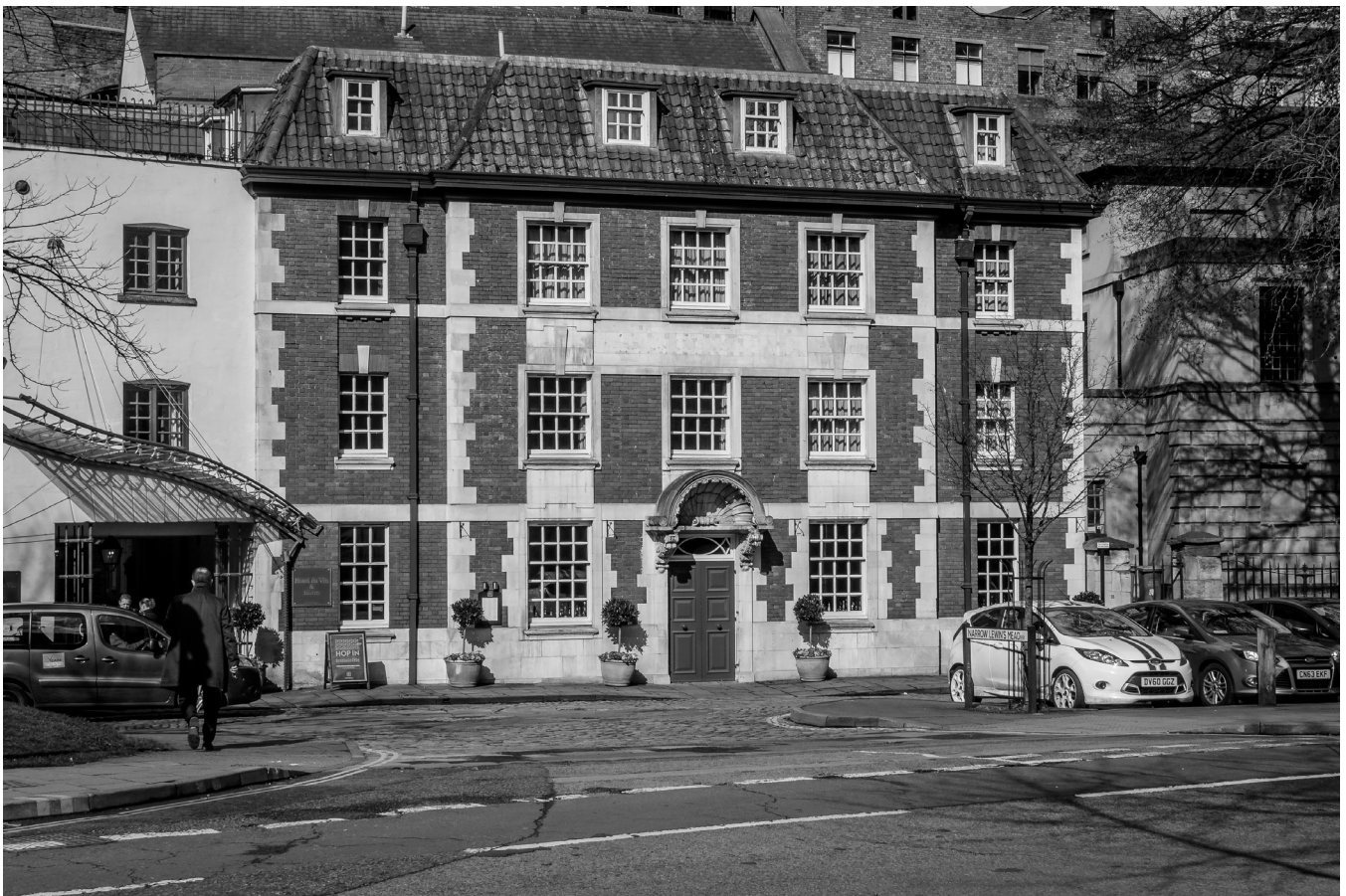
The former premises of Capern's in Bristol, showing the decorative hood placed above the building's main entrance in 1922.