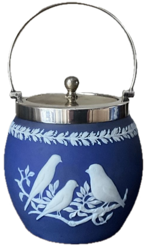
Wedgwood/Capern's biscuit barrel