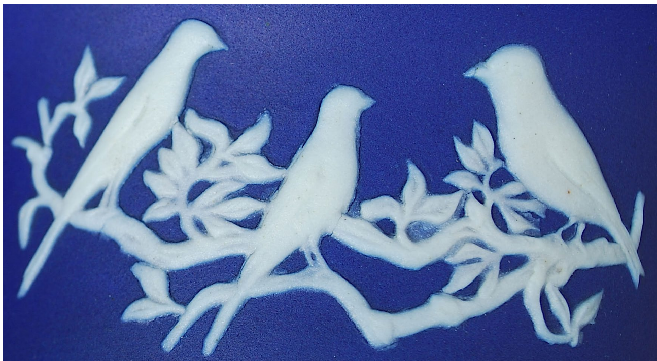
Imagery of Yorkshire Fancy, Lizard and Norwich Fancy canaries (left to right) decorated the canary items in the range.

Capern’s decided to commission the famous pottery firm of Josiah Wedgwood & Sons Ltd to produce a highly desirable and unique tea service in their famous blue jasperware style, which could be awarded to the owners of winning birds. This featured the silhouettes of three of the most popular canary breeds of the time, in the guise of Yorkshire Fancy, Lizard and Norwich Fancy canaries, each of which were fortuitously recognizable by their distinctive outlines.