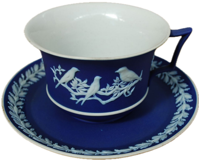
Wedgood/Capern's cup and saucer

Most but not all of these pieces are stamped with “Caperns Ltd Bristol” on their base, and were manufactured by Wedgwood between 1930 and 1934, at their Etruria factory in Staffordshire, although it is believed the earliest examples may date back to 1925. There is some variation in the depth of blue glaze on these pieces, with the majority being typically dark in colour.