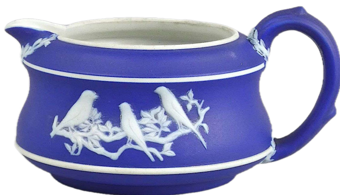
Wedgood/Capern's milk/cream jug