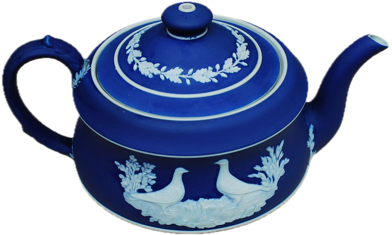
Wedgood/Capern's tea pot