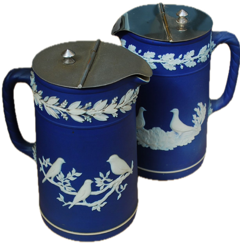
Wedgwood/Capern's coffee pots