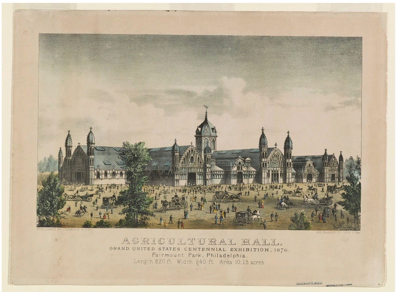
Image of the Agricultural Hall.

The advertisement claims that E.W. Taxis is “the oldest in the United States,” and touts their position as the only manufacturer in Philadelphia experienced in the production of specialty tanks. Specifically, they promote their aquariums made of iron, slate, marble, or combined materials, and emphasize their ability to ship said tanks to buyers in the U.S. and Canada. Despite these claims no additional records of E.W. Taxis have been identified in readily accessible archival or digital sources, suggesting the firm may have been a small, short-lived aquarium manufacturer.