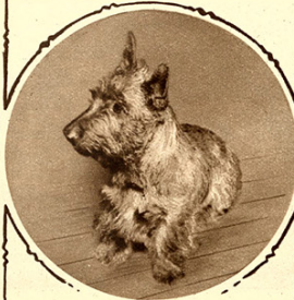
Joan Crawford's Scottish.