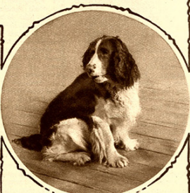
Joe E. Brown's Spaniel.