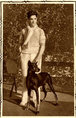
Ramon Novarro and one of his best friends.