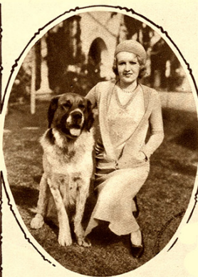
Anita Page and her St. Bernard.