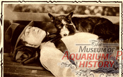
Frank McHugh with his Doggy Pal.