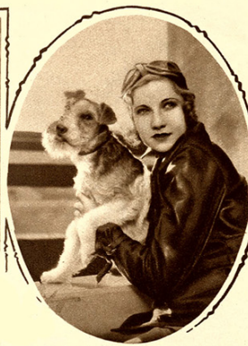
Una Merkle with her friend "Zip."