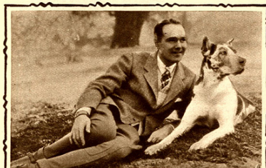
William Haines has a Great Dane.

Having had their ups and downs they know from experience that there is no better friend than a dog for sticking to one through good and bad times.