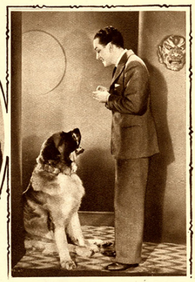
Gene Gerrard having a chat with his St. Bernard, "Noble."